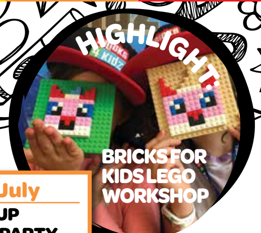
BRICKS FOR KIDS LEGO WORKSHOP