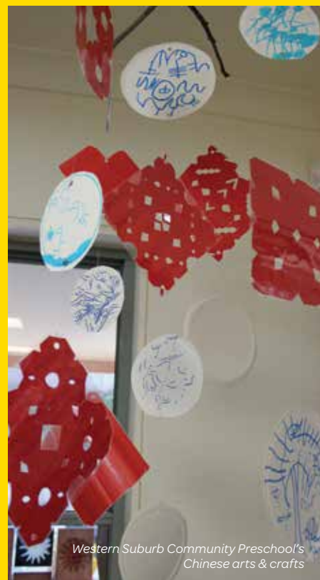
Western Suburb Community Preschool's Chinese arts & crafts

The children are involved in monitoring the growth of vegetables and herbs, plus picking them to use within the preschool menu.